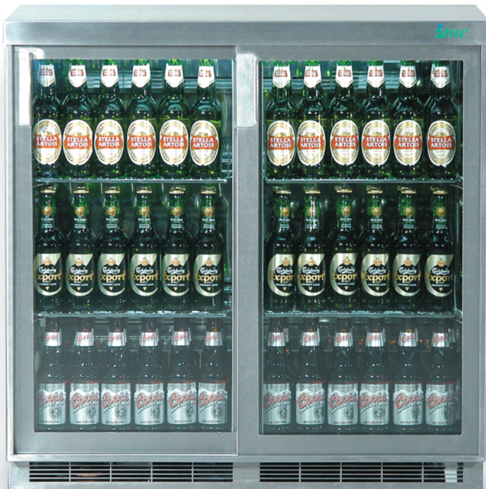
M90 also available with sliding doors

Easily adjustable shelving layout provides high product visibility, while energy efficient forced air cooling ensures that drinks are kept at the perfect serving temperature.