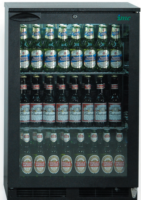
Mistral range also available in black or silver

Lockable doors are standard on all Mistral bottle coolers, with a range of options including solid doors and wine shelves on each model, with sliding doors available on the M90.